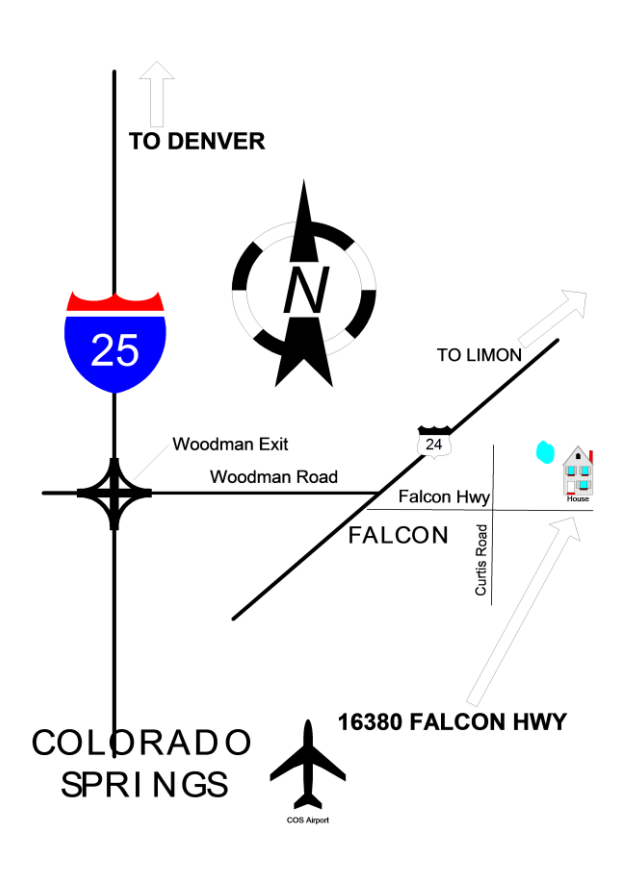
From I-25 North or South: Take Woodmen Road Exit and travel east to Highway 24. Turn Right on Highway 24 and then turn Left on Meridian. Go to stop sign and then Turn Left on Falcon Highway. Turn Left in driveway at 16380 Falcon Highway.